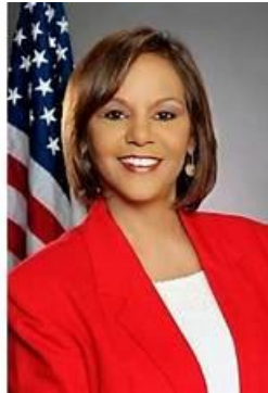
Rep. Robin Kelly

Join us on Tuesday, March 16 th at 1:00pm – 1:30pm via zoom